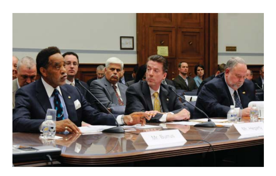
President Burrus refutes management claims about consolidation in testimony before a House panel on May 20, 2009.

One way to debunk management's claim is to request copies of USPS documents, analyze them, and point out discrepancies. This can be a frustrating process, because management is often slow