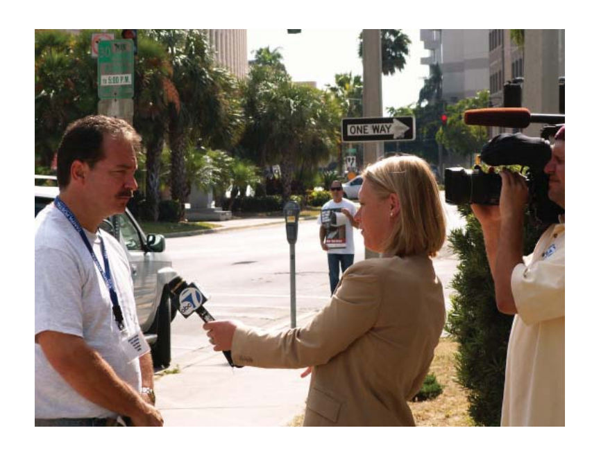
The Southwest Florida Area Local generates media coverage.

There are several ways to generate media attention: Submit letters to the editor and Op/Ed articles ( See Pages 10-13 ); arrange for interviews on local radio talk stations; "pitch" the story to television and radio news stations; and conduct news-worthy events, such as picketing, leafleting, and press conferences. ( See Pages 14-16 .)