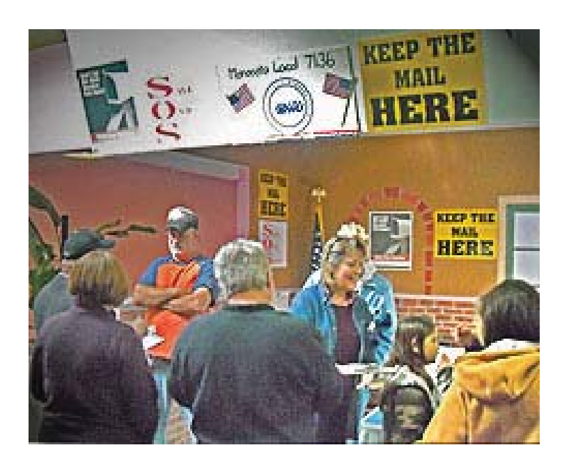
The Manasota (FL) Local wins community support through an aggressive outreach campaign.

And criticism from the GAO continues. Despite its stated objective "to minimize the degree to which any mail plant consolidations results in downgrades to the First-Class Mail service standards," the agency reported in July 2008 that, "USPS has not established measurable performance targets for its realignment initiatives." (GAO-08-1022T) The GAO reiterated those concerns in September 2008. (GAO-08-1134R)