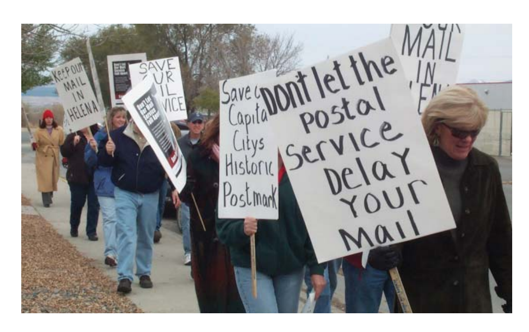
Helena MT Local members protest consolidation at rally in October 2006.

APWU local unions alerted their legislators, local media, and neighbors about the possible curtailment of mail processing and what it would mean for service. The subsequent opposition in many communities played an important