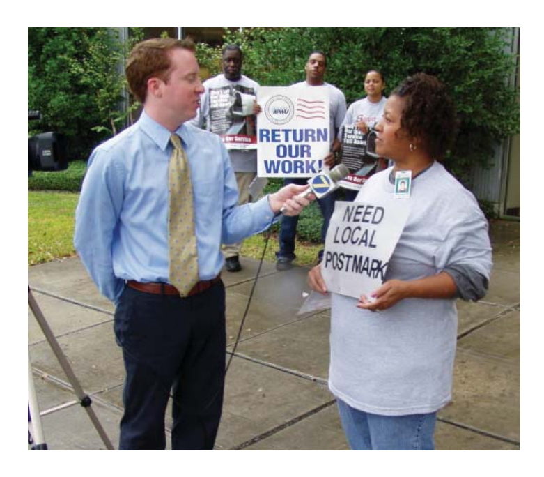
The Southwest Louisiana Area Local emphasizes the importance of a local postmark.