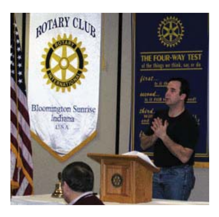
Members of the Bloomington (IN) Local reach out to community organizations.

If the media and our legislators hear only from postal workers, they are likely to disregard our concerns as narrow self interest. If, on the other hand, we are able to persuade business groups, senior citizens, residents of rural communities, community activists, residents of poor neighborhoods, and others that they, too, have a stake in this fight, we are more likely to be successful.