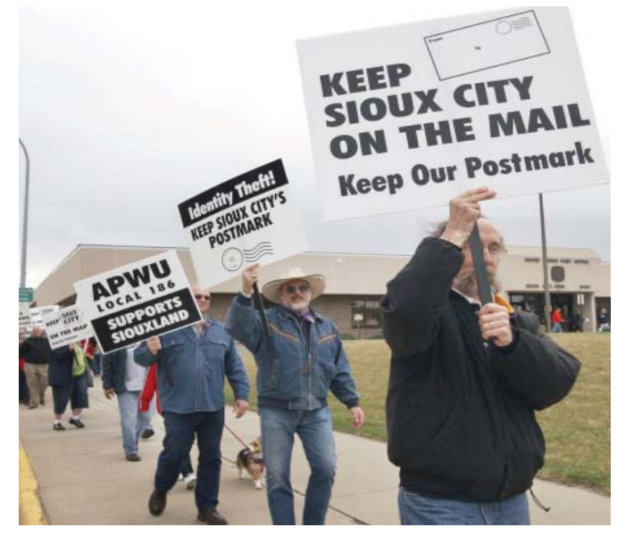
Members of the Sioux City (IA) Local rally opposition to moving mail processing across state lines.

The Access to Postal Services Act (H.R. 658) would require improved notification to affected communities, and would strengthen commitments to service. It would require the USPS to conduct an investigation to determine if there is need for the proposed consolidation, and to notify members of the affected community by mail and in area newspapers. In deciding whether to consolidate a facility, the Postal Service would be required to consider the effect on the community and employees, while continuing to provide "a maximum degree of effective and regular postal services to rural areas, communities, and small towns." The USPS would be required to post the decision and findings prominently in each postal facility