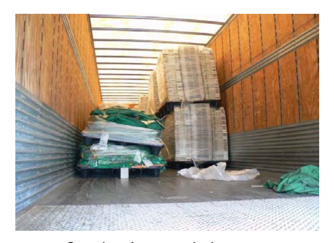
Stored equipment at the Lancaster Processing and Distribution Center, October 9, 2007.

We also determined that although the National Trailer Lease was intended to provide trailers to meet transportation requirements, the Eastern Area had too many roadworthy<sup>3</sup> national lease trailers being improperly used for storage. For example, the Philadelphia and Pittsburgh BMCs reported that combined, they were using nearly 90 trailers, or almost 50 percent of their leased fleet, for this purpose.