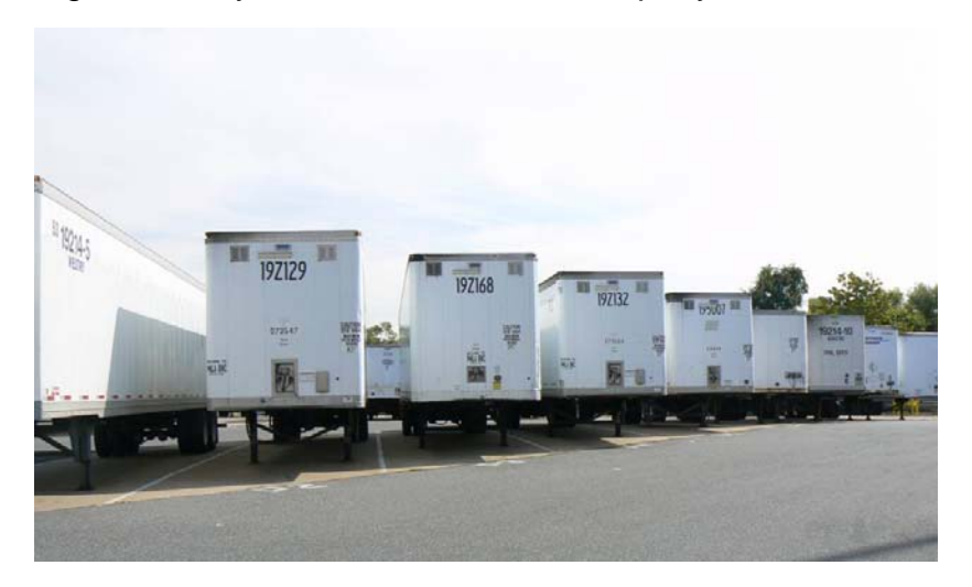
The Postal Service uses a unique numbering system for TIP "National Trailer Lease" trailers it assigns to facilities. These trailers, beginning with the numbering sequence "19Z," were photographed at the Philadelphia Bulk Mail Center (BMC) on October 10, 2007.

<u>Initial National Trailer Lease</u> – In September 2000, the Postal Service signed a National Trailer Lease contract for 4,475 trailers with TIP, Inc., a wholly-owned trailer and equipment leasing subsidiary of General Electric Company.