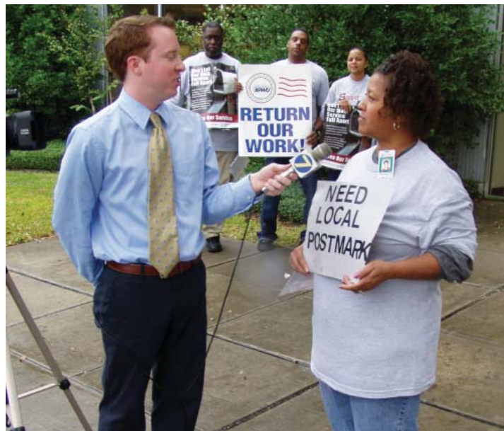
The Southwest Louisiana Area Local emphasizes the importance of a local postmark.