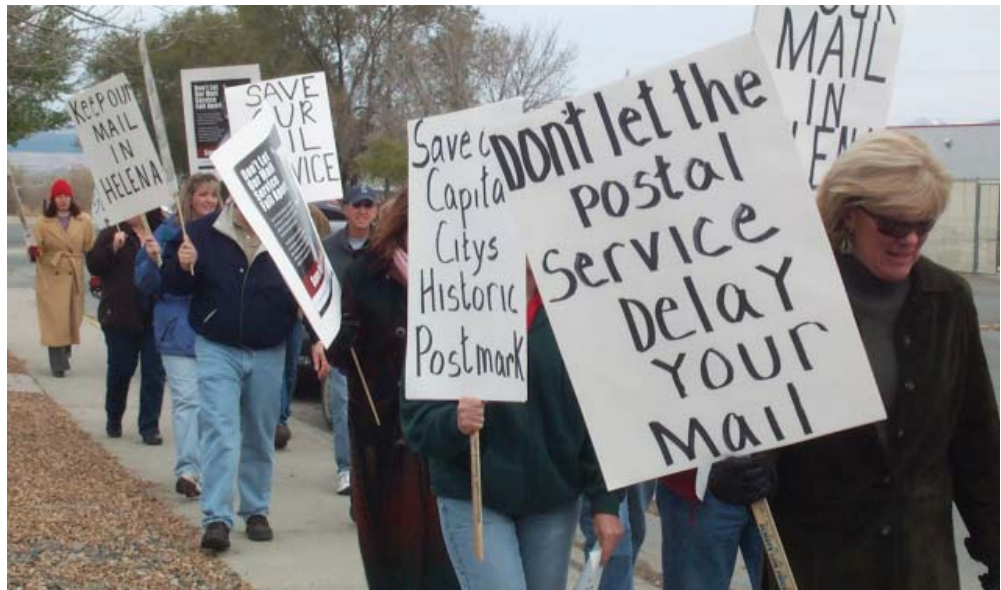
Helena MT Local members protest consolidation at rally in October 2006.

APWU local unions alerted their legislators, local media, and neighbors about the possible curtailment of mail processing and what it would mean for service. The subsequent opposition in many communities played an important role in derailing USPS consolidation proposals. In 2006 and 2007, 37 consolidation initiatives were terminated, placed on hold, or reversed.