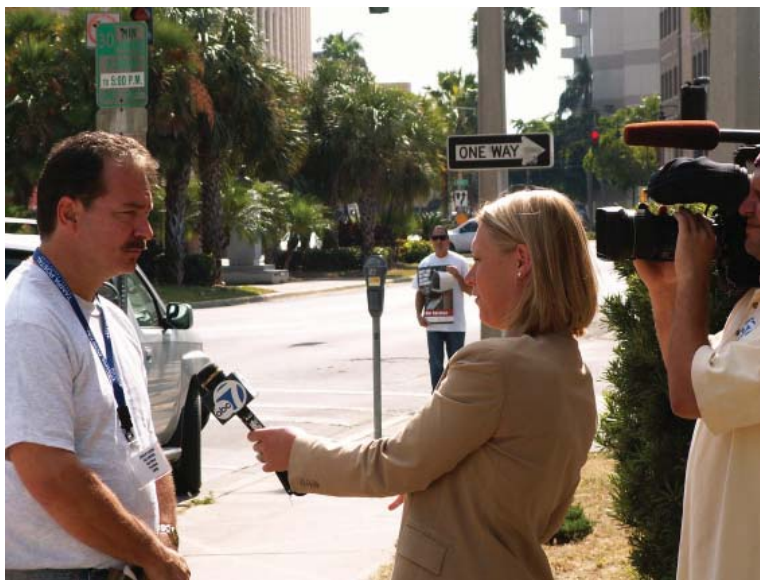
The Southwest Florida Area Local generates media coverage.

There are several ways to generate media attention: Submit letters to the editor and Op/Ed articles ( See Pages 10-13 ); arrange for interviews on local radio talk stations; “pitch” the story to television and radio news stations; and conduct news-worthy events, such as picketing, leafleting, and press conferences. ( See Pages 14-16. )