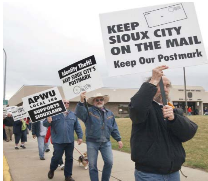
Members of the Sioux City (IA) Local rally opposition to moving mail processing across state lines.

The Access to Postal Services Act (H.R. 658) would require improved notification to affected communities, and would strengthen commitments to service. It would require the USPS to conduct an investigation to determine if there is need for the proposed consolidation, and to notify members of the affected community by mail and in area newspapers. In deciding whether to consolidate a facility, the Postal Service would be required to consider the effect on the community and employees, while continuing to provide “a maximum degree of effective and regular postal services to rural areas, communities, and small towns.” The USPS would be required to post the decision and findings prominently in each postal facility