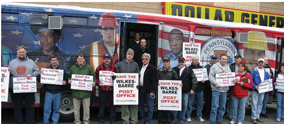
Wilkes-Barre (PA) Area Local members picket against USPS plans to shift mail processing operations.