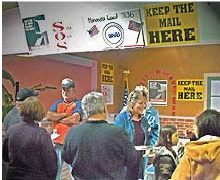
The Manasota (FL) Local wins community support through an aggressive outreach campaign.

And criticism from the GAO continues. Despite its stated objective “to minimize the degree to which any mail plant consolidations results in downgrades to the First-Class Mail service standards,” the agency reported in July 2008 that, “USPS has not established measurable performance targets for its realignment initiatives.” (GAO-08-1022T) The GAO reiterated those concerns in September 2008. (GAO-08-1134R)