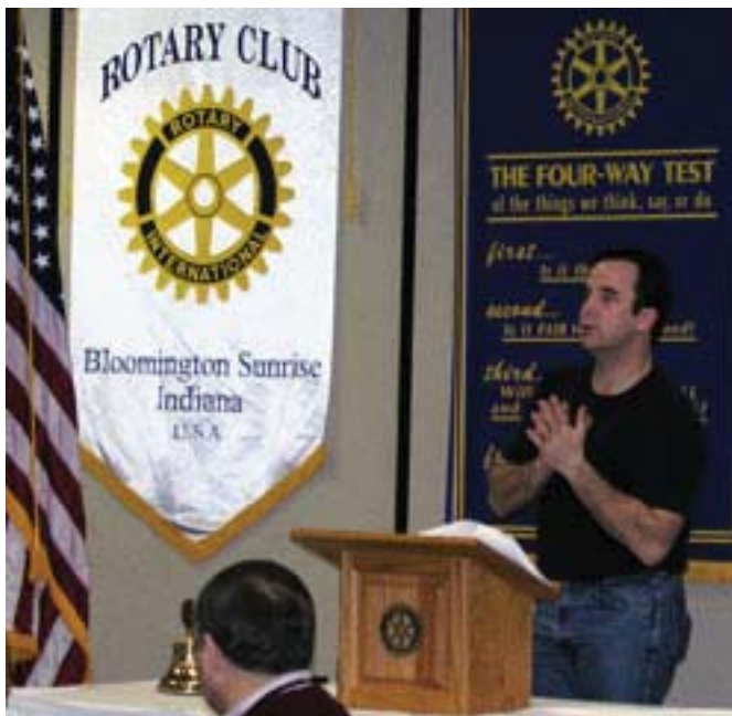
Members of the Bloomington (IN) Local reach out to community organizations.

Once you have the formal support of a community group, be sure to keep in touch with them, and include the fact that they are supporting you in your press materials and in letters to elected officials.